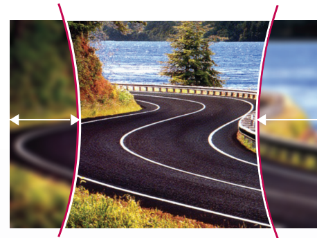
Conventional front surface multifocal

At Millennium Optical we are dispensing the latest multifocal technology lenses to provide you with the very best vision.