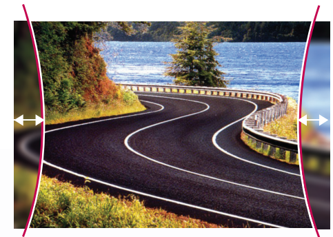
Free Form Wide Multifocal

SPECIAL $140 For Pair of Multifocal Lenses